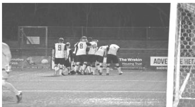
St, Martins players celebrate their victory v FC Oswestry